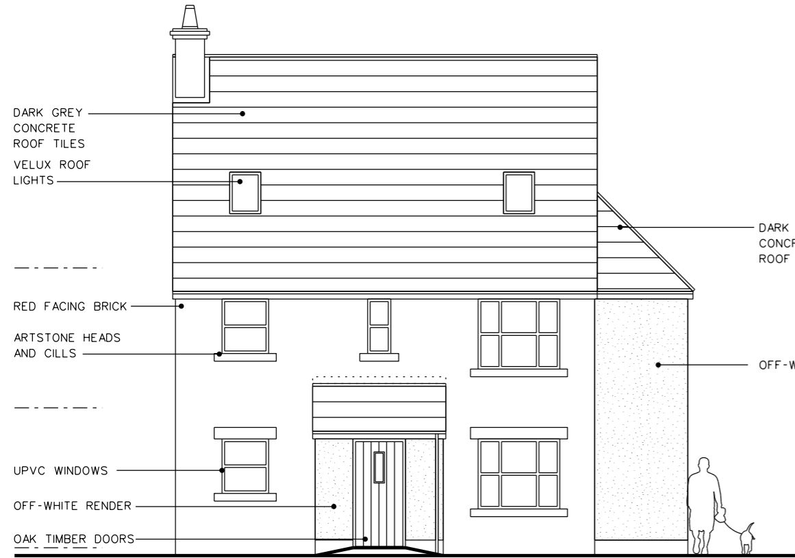
PROPOSED FRONT ELEVATION (DWELLING 7)