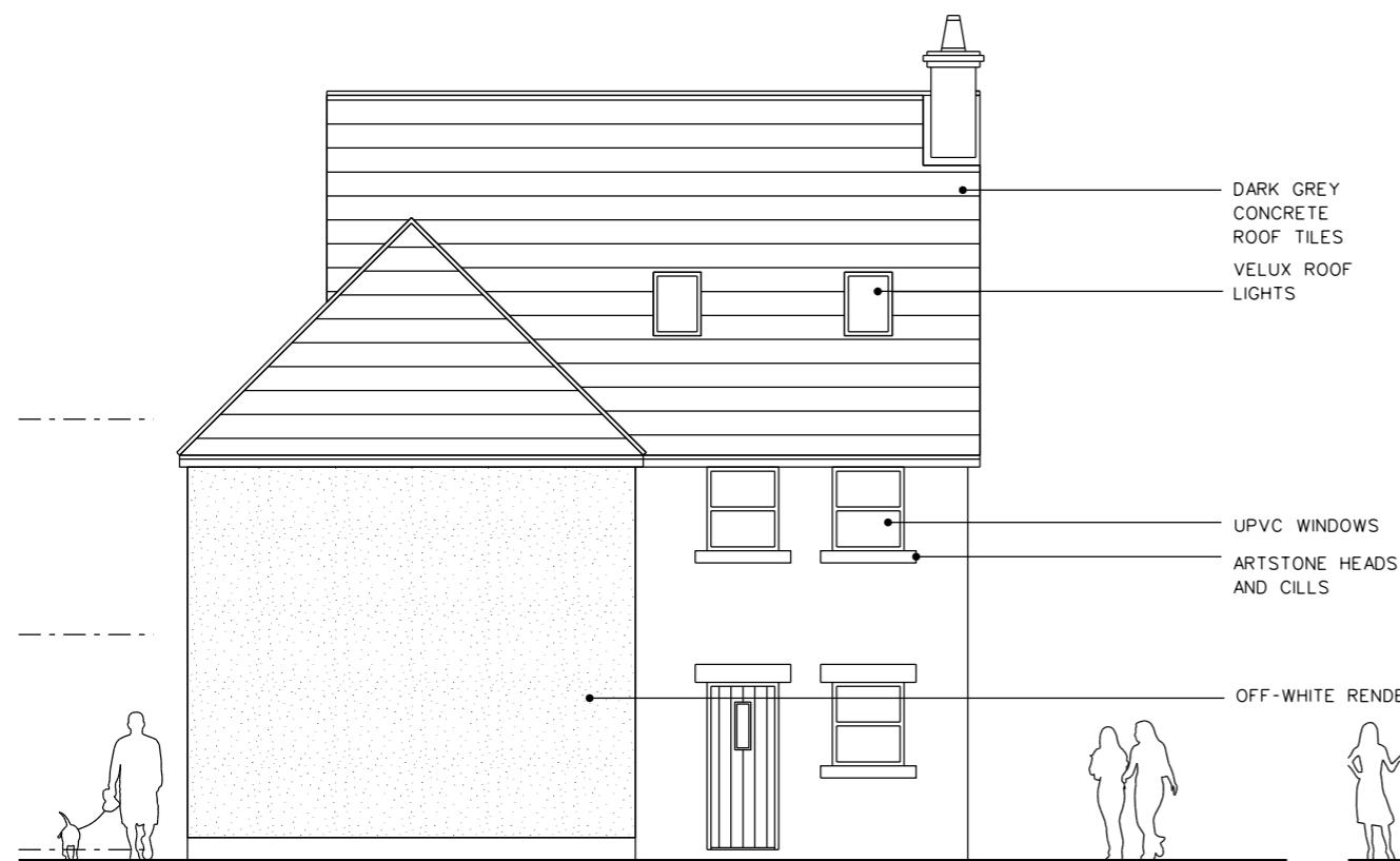
PROPOSED REAR ELEVATION (DWELLING 7)