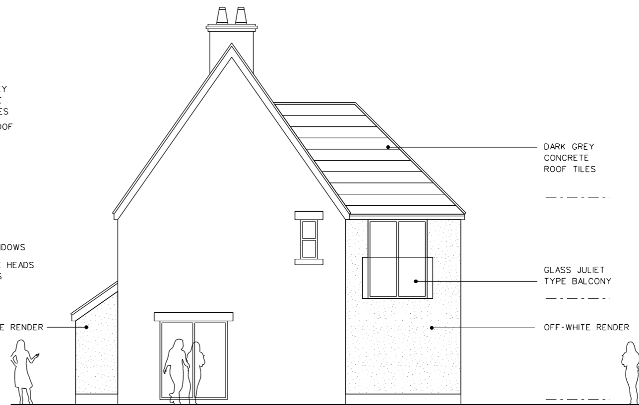
PROPOSED SIDE ELEVATION (DWELLING 7)